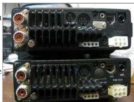
Figure 1: This view shows two ICOM 706 radios, one with the painted letters (bottom) and one without (top). Click here for a larger image.

You will find you have to replace the stick several times and spray a new puddle of paint when the old puddle gets too thick. You will also need to have some small paper towels and rubbing alcohol close by to quickly clean up any mistakes. I strongly recommend you practice this on some junk metal before attempting this on your expensive radios. I have also used this same trick on unpainted numbers for my Chevy truck 4 wheel drive shift mounted on the truck floor and for my watch bezel to make the unpainted numbers easier to read.